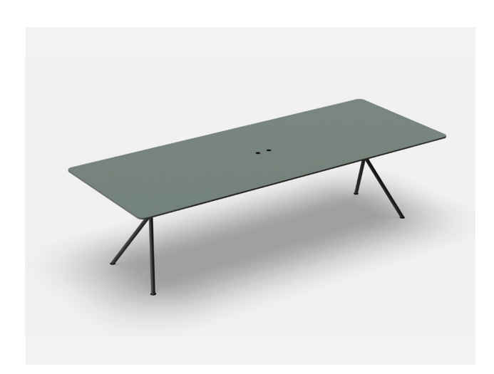
A | 1x 2 Netbox spots