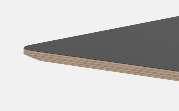
Plywood, top layer laminate Fenix | 25 mm