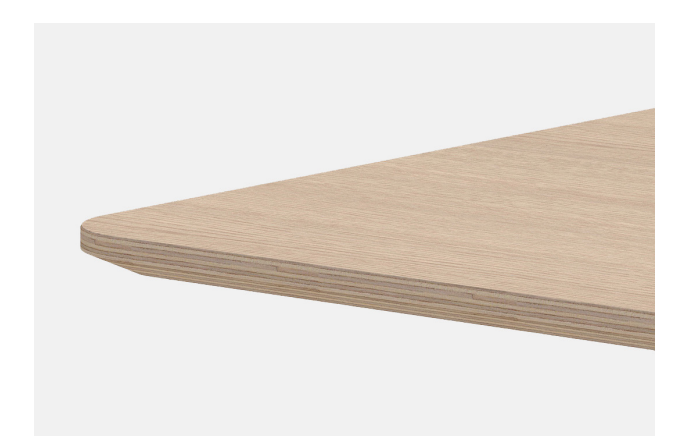
Plywood, top layer oak veneer | 25 mm

The edge is always chamfered milled (5 mm), excluding solid core Arpa Fenix.